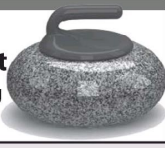
Karen Sotvedt Throwing rocks

It is now less than two weeks to end of a very successful and eventful five months at Middleton Curling Club.