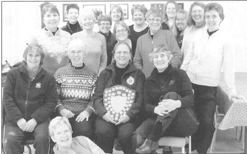
Pictured are members of the Berwick and Middleton ladies curling clubs at this years home-and-home event.

This Home and Home is one of several events that bring the players of these two clubs together to enjoy friendly competition and pleasant social time. The on-going relationship between the clubs is strong. Curlers from Middleton are front and centre in the Berwick Apple Spiel,